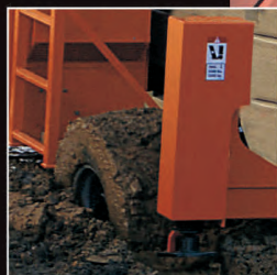
Unmatched Rough Terrain Performance